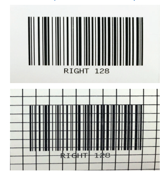
T8000 strikes through the entire "bad" label then reprints the label correctly.